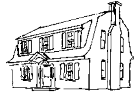
Dutch Colonial Revival