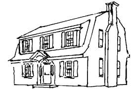
Dutch Colonial Revival